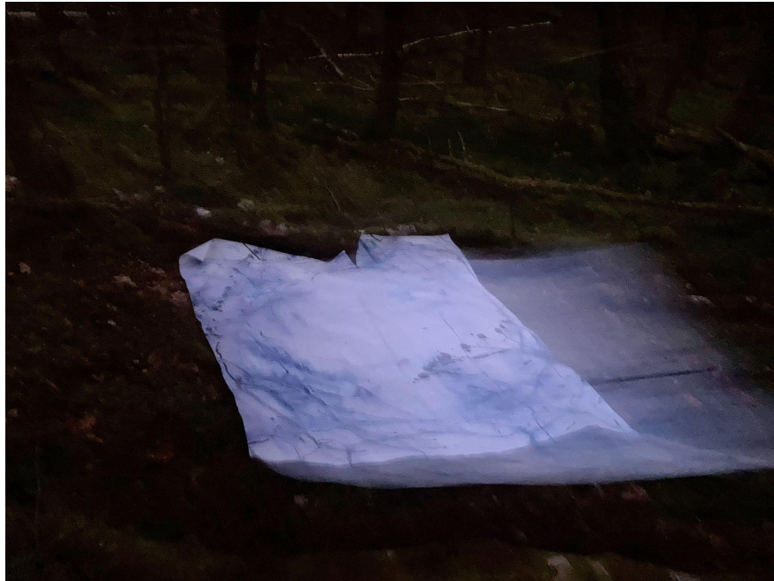
Forest studio, Beinn Eighe, April 2023.

Forest floor picnic dinner: Sat 11 November, 19:00